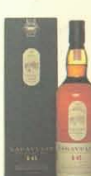
LAGAVULIN From the Isle of Skye. A 10 year old with a rich, smoky, bold and powerful aroma. Smooth, pure, steady and earthy. One of the most powerful of Scotch whiskies.