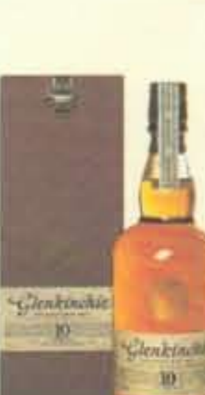
GLENKINCHIE From the Lowlands. This 10 year old has the distinction of being the driest and most consistent of the specially soft and sweetened Lowland Malt.

A very special motoring event has been created, which will take invited sporting owners of Vintage, Historic and Classic cars to each of the six distilleries producing Scotland's finest single malt whiskies.