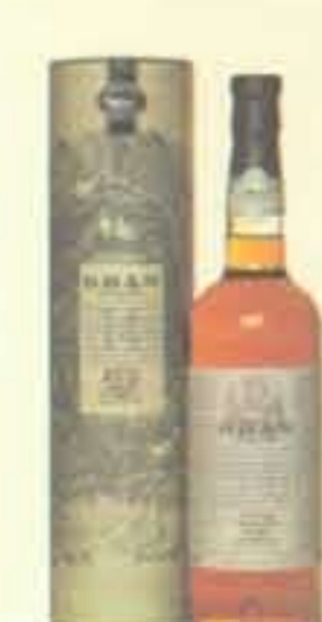
OBAN From the West Highlands. A 14 year old with a complex malt with the most suggestive of peat in the world. Slightly smoky with a long smooth finish.