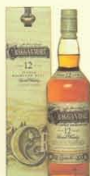
CRAGGANMORE From Speyside. A finely balanced 12 year old with good fine body and smoky finish. A pleasantly dry and elegant scotch.