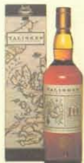
TALISKER From the Isle of Skye. The ultimate peat smoke, produced by Robert Louis Stevenson. A 10 year old with a pungent peaty character. It explodes on the palate and lingers on. A scotch whisky to treasure.