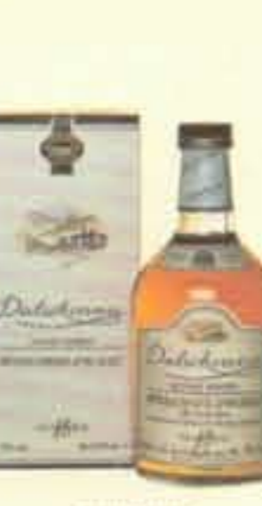
DALWHINNIE From the Highlands. A 14 year old with a light and generous with a soft, buttery honey finish. The gentle spirit, rich in body.